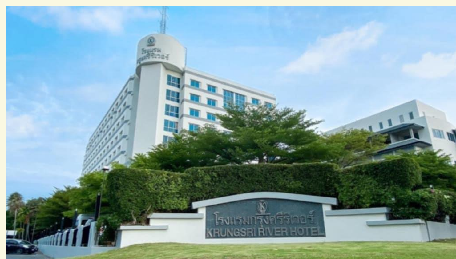
Fig. 4. Title of the Figure. (16 point font)

ICMMA 2024 will not make contract-hotels for participants. However, if you need ICMMA 2024 help to book hotel, please inform us through Email